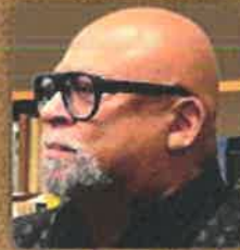
DR. MAULANA KARENGA Chair, Africana Studies, CSULB