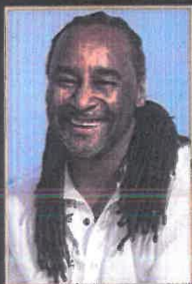
ERIC JEROME DICKEY Before We Were Wicked